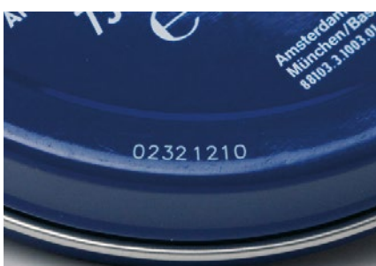
Writing on painted tins

The single operating concept for all REA JET technologies.