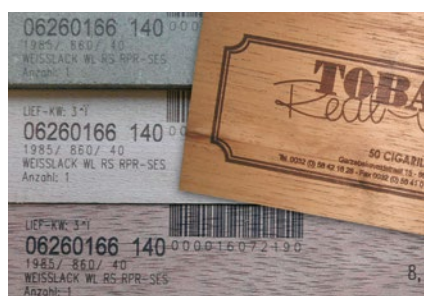
Marking of wooden profiles