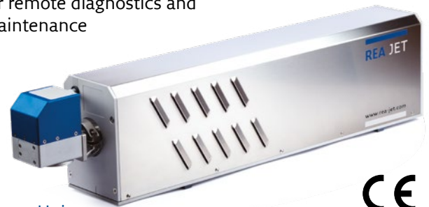
CL Laser Unit