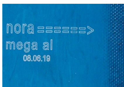
Marking of composite materials