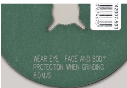
Writing on sanding discs