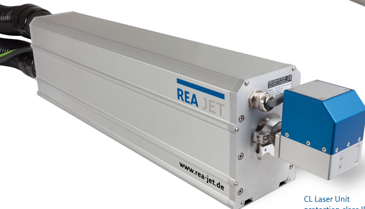
CL Laser Unit protection class IP65