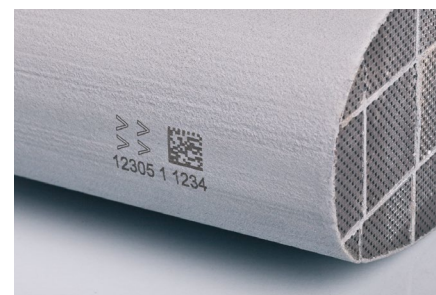
2D-Code marking of soot particle filters