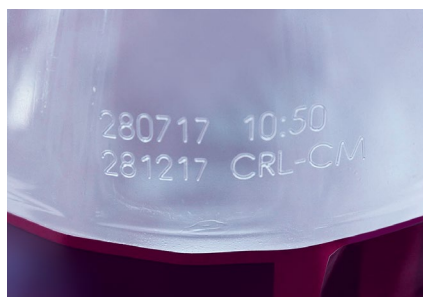
Marking of PET bottles