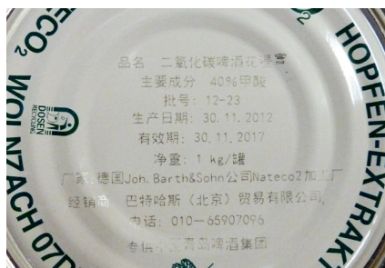
Marking of cans