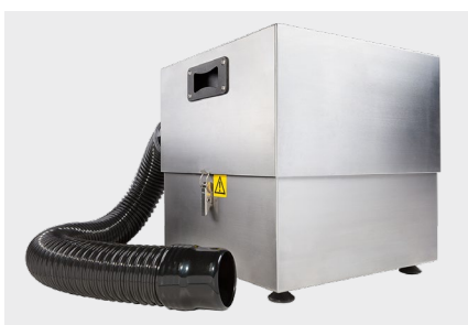
Accessories: Cooling Unit