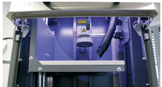
Flexible placement of suction hose