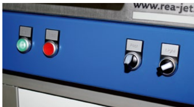
Laser workstation basic function operation panel