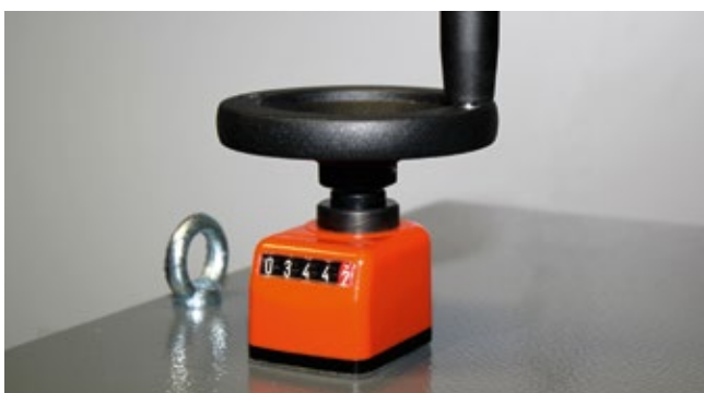
Handwheel for adjustment of product table