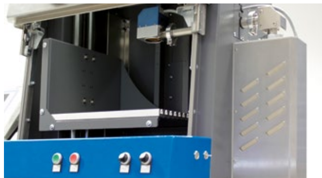
REA JET CL CO 2 -Laser mounted sideways